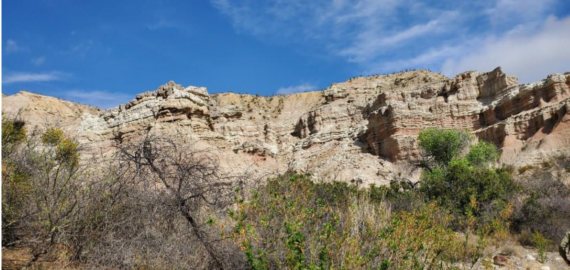
Big Bend National Park in Texas - Photo Credit to: TBPG