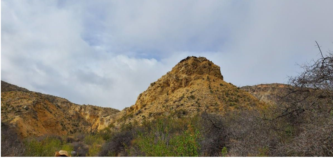
Red River - East Texas - Photo Credit to: TBPG